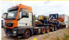
MARKT & MARKEN: WINDFLÜGEL-TRANSPORTSYSTEM FREIGEGEREN