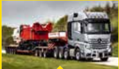
STM SPEZIAL: AUF ALLEN VIEREN