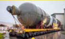
IN AKTION: REKORD-TRANSPORT AUF DEUTSCHEN STRASSEN